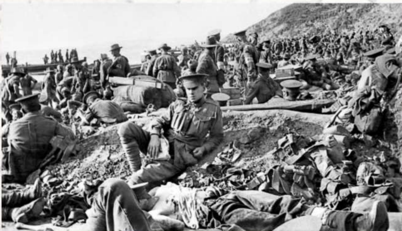
Troops ashore at Anzac Cove, 1915