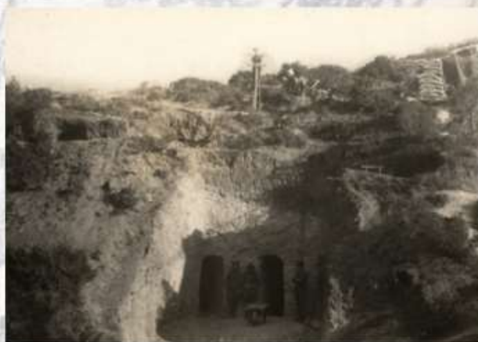
Underground signalling office, No.2 Outpost, Gallipoli 1915.

I was up at the trenches in afternoon. One trench was packed full of dead Turks, Some in a very bad state. We had to walk over these to get to the extreme left Sap where we could see the ground simply covered with dead Turks. Some of them were right up on our parapets. In this place the trenches are only about fifteen yds away from each other. Our men busy getting these dead Turks out of the way as soon as possible.