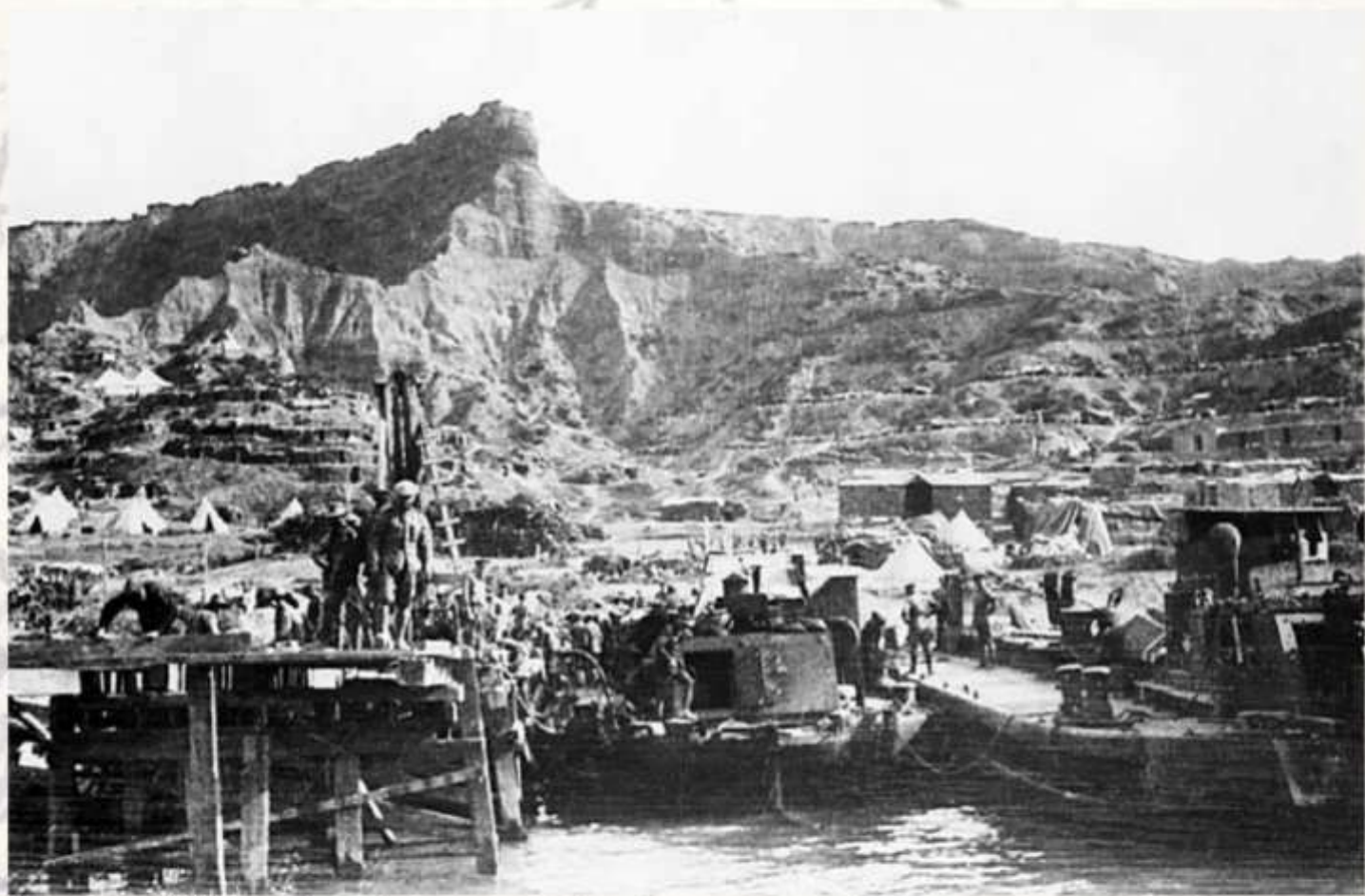
Williams Pier, North Cove, Anzac Cove

The food supply has been very good so far. Also the water. They have the Mule Corps going all day. It is doing very good work.