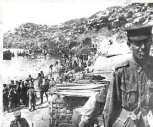
Troops at Anzac Cove, 1915