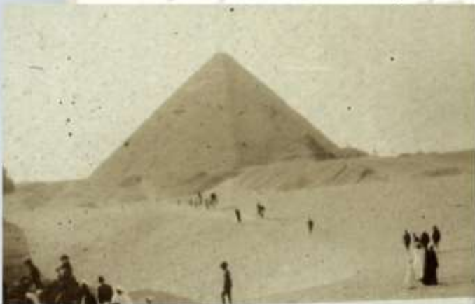
Pyramid at Giza.