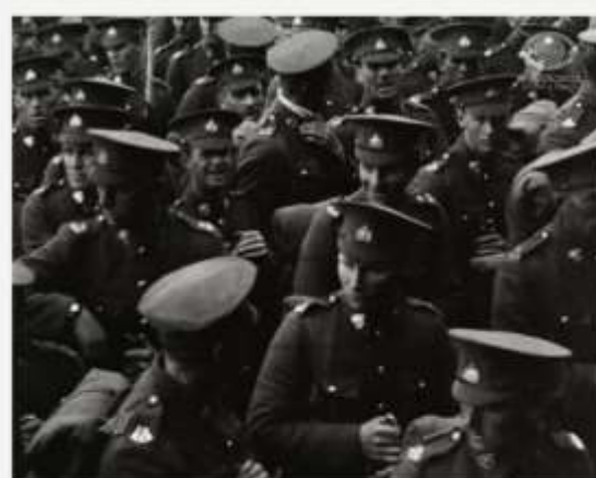
Otago recruits to the 1st NZ Expeditionary Force being farewelled at Tahuna Park, Dunedin, 17 September 1914