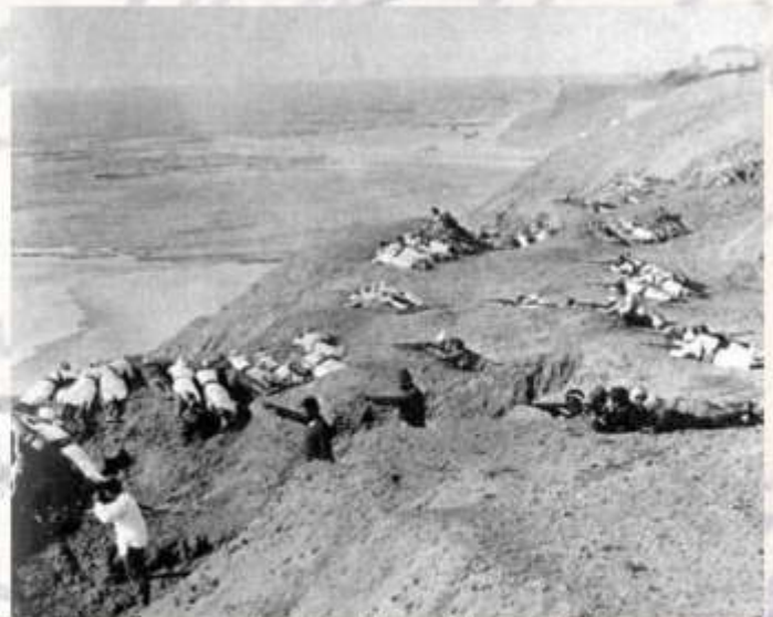
Turkish troops on the high ridges of the Gallipoli Peninsula

Landing 2 mile North Gaba Tepe by supposed mistake.