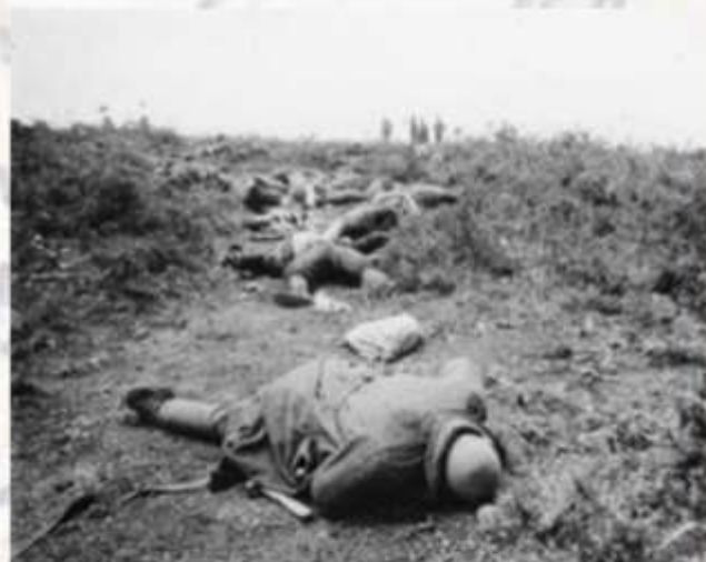
Bodies of dead Turks

The Turkish trenches are on the hill right opposite them. The Australians are entrenched about 200yds in advance to the right of our position. The Turks seem to be very well entrenched. I watched a few shells from our artillery lobbed into them while I was there, but it did not seem to make much impression. I believe the Indian Mountain Battery got well on to their trenches early this morning, killing a few of them while others were caught while jumping out of the trenches attempting to escape, by Capt Wallingford's Machine Guns. I could see these bodies lying all along the back of the trench. Just outside our trenches there are a few dead. They have been lying there since last Sunday week. Our boys have been successful in burying a few, but this is rather a dangerous game at present. The smell from them is becoming most unpleasant.