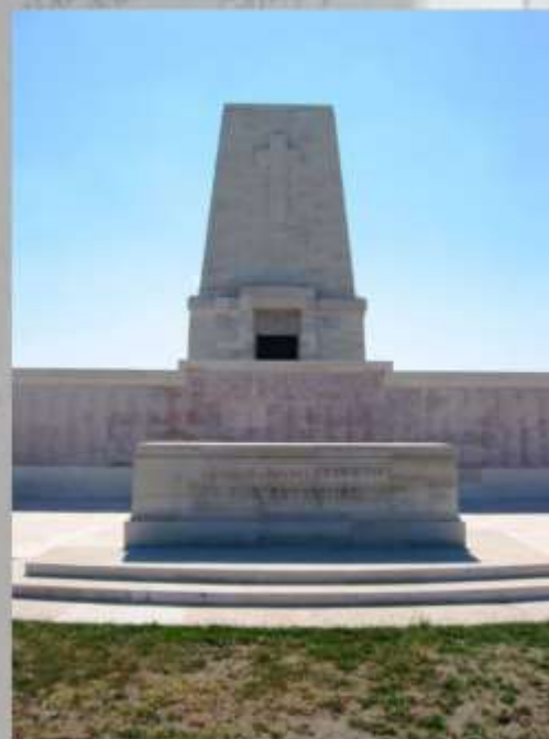
Memorial to the Missing, Lone Pine Cemetery, Gallipoli