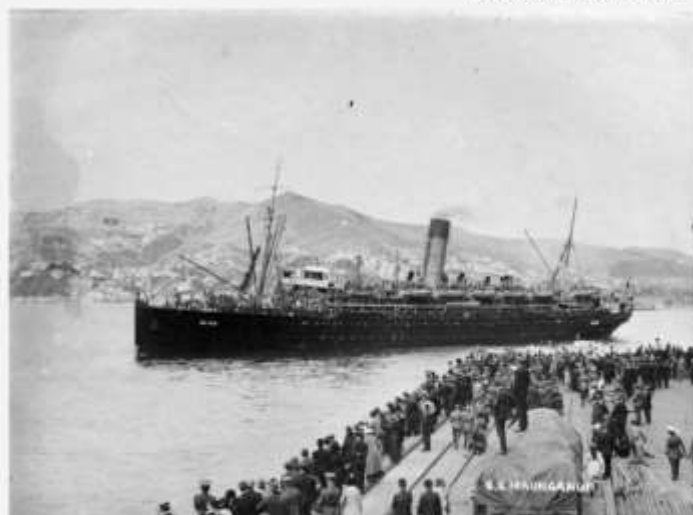
Troopship Maunganui, HMNZT 49, in Wellington Harbour. DK Haig's voyage included 528 men, 38 officers and 204 horses. Nine other troopships left Wellington at the same time