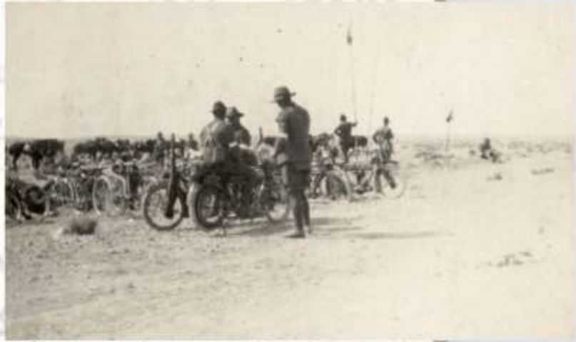
Signalmen in Cairo on motorbikes, horses and bicycles