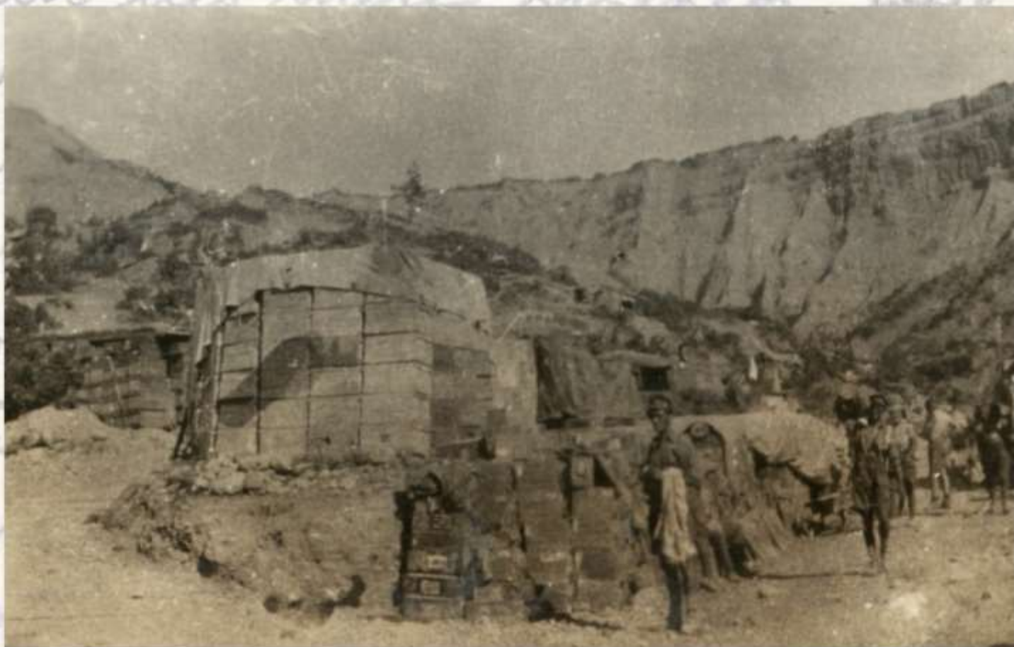
Supply dump, Ocean Beach, below Walkers Ridge. Photo by Gordon Catto, friend of DK Haig

There has been hardly a shot fired all Day. Just before sundown the Destroyers named Pincher + Rattlesnake gave us an exhibition of the fine gunnery by lobbing a few shells into the old No 3 outpost.