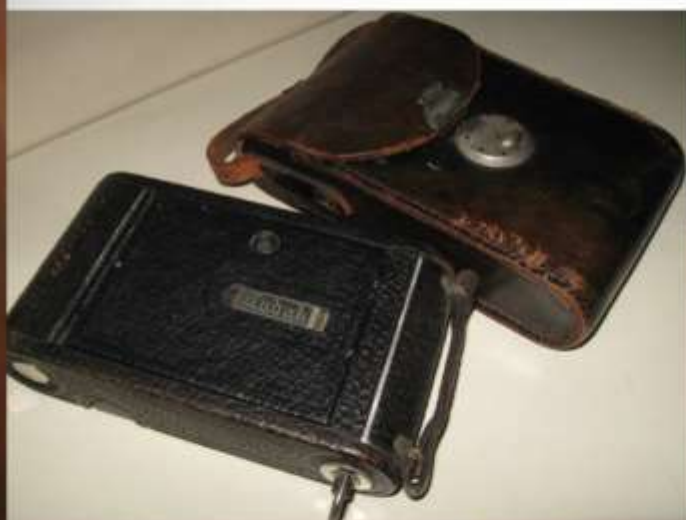
Camera of DK Haig, purchased in Cairo, January 1915