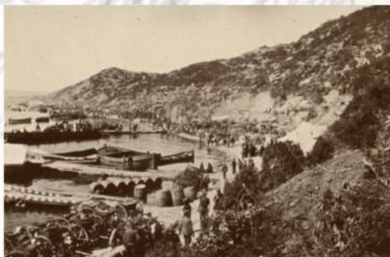
Anzac Beach, looking towards Ari Burnu.

Saturday 5th June. Very quiet with exception of early morn at Quinns Post. A few Turks were captured and taken as prisoners. Our casualties are reported as close on one hundred.