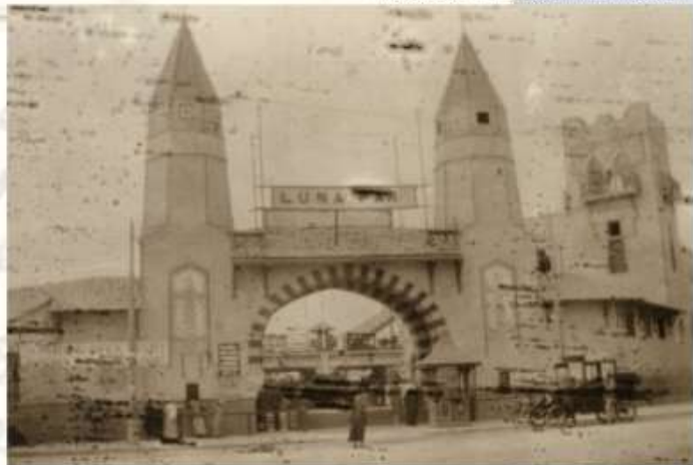
Luna Park, Héliopolis.