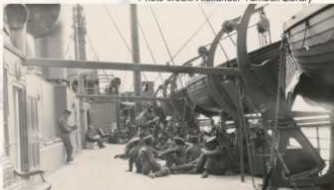
NZ soldiers on board the troopship Maunganui