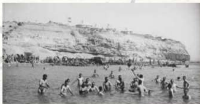
Swimming at Anzac Cove

Friday [30th April] has opened out very quiet indeed. As far as I can gather, the positions are much the same. Our boys are now enjoying a well deserved spell. There is a little exchanging shots with the artillery, but I have not heard of any particular damage being done as yet.