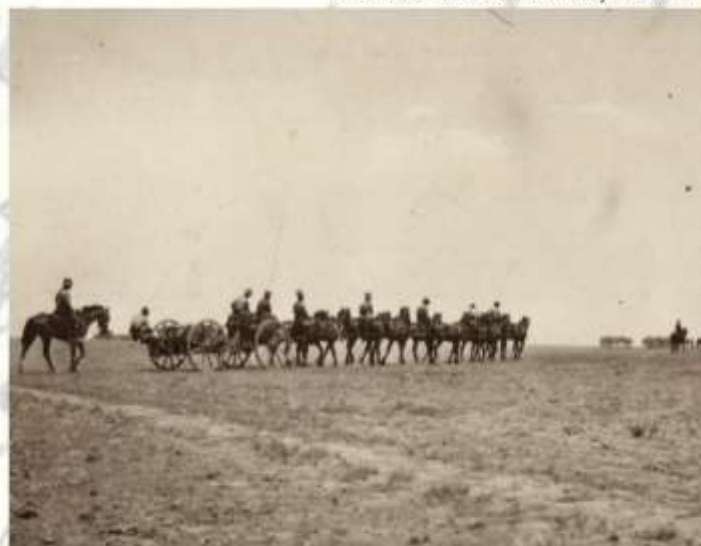
NZ signallers laying cable using horses and wagon